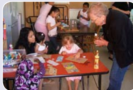
Puppet Making at The Courts

In addition to safe, affordable living conditions, children at Northlake Grove, Easternwood and The Courts benefited from volunteer-led activities and homework nights.