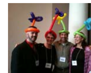
Staff "Best-of-Live" sellers

Thank you to all who attended or participated in our 2011 auction, Sky's the Limit! We were at a fabulous new venue this year--the Museum of Flight. We raised a record $316,661! Join the fun next year: March 10th, 2012.