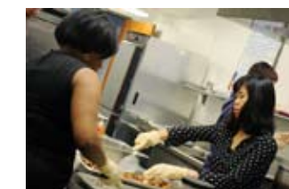
In the kitchen