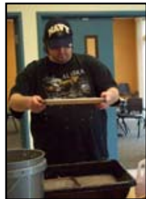
"Pulling" a sheet