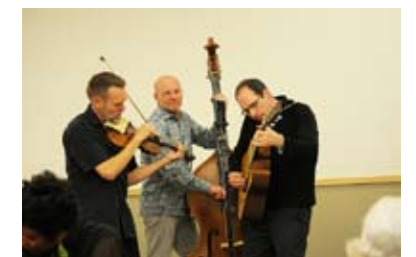
The Shed Boys

If you wish to be removed from this newsletter list, please email llund@compasshousingalliance.org