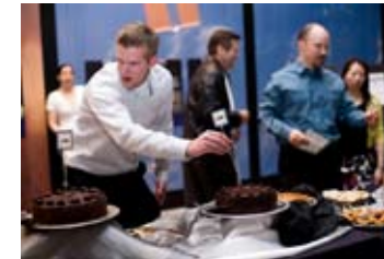
Guests "dash" for their desserts