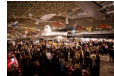
Guests bid on auction items under plane wings at The Museum of Flight