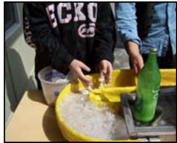
Turning uniforms into pulp with a beater machine

Luther's Table, located on the first floor of the Veterans Center, will be displaying some of the finished pieces. More information about the project can be found at www.combatpaper.org .