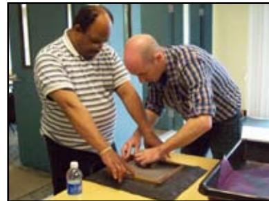
Releasing the paper from the mold