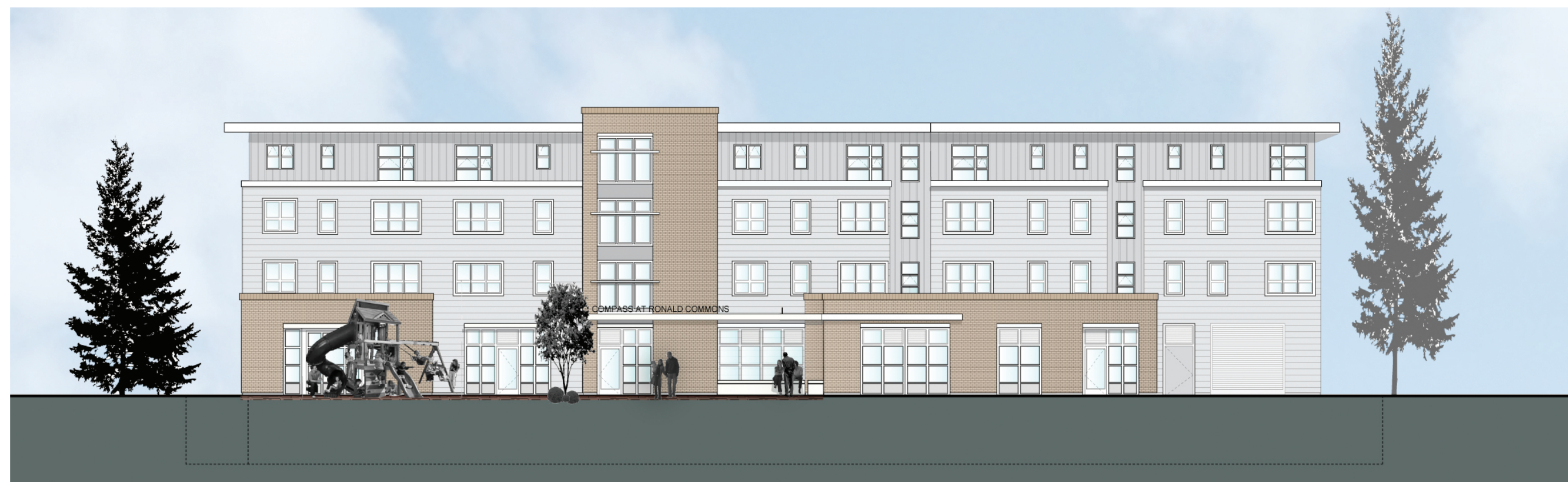
EAST ELEVATION | FACING RONALD UNITED METHODIST CHURCH