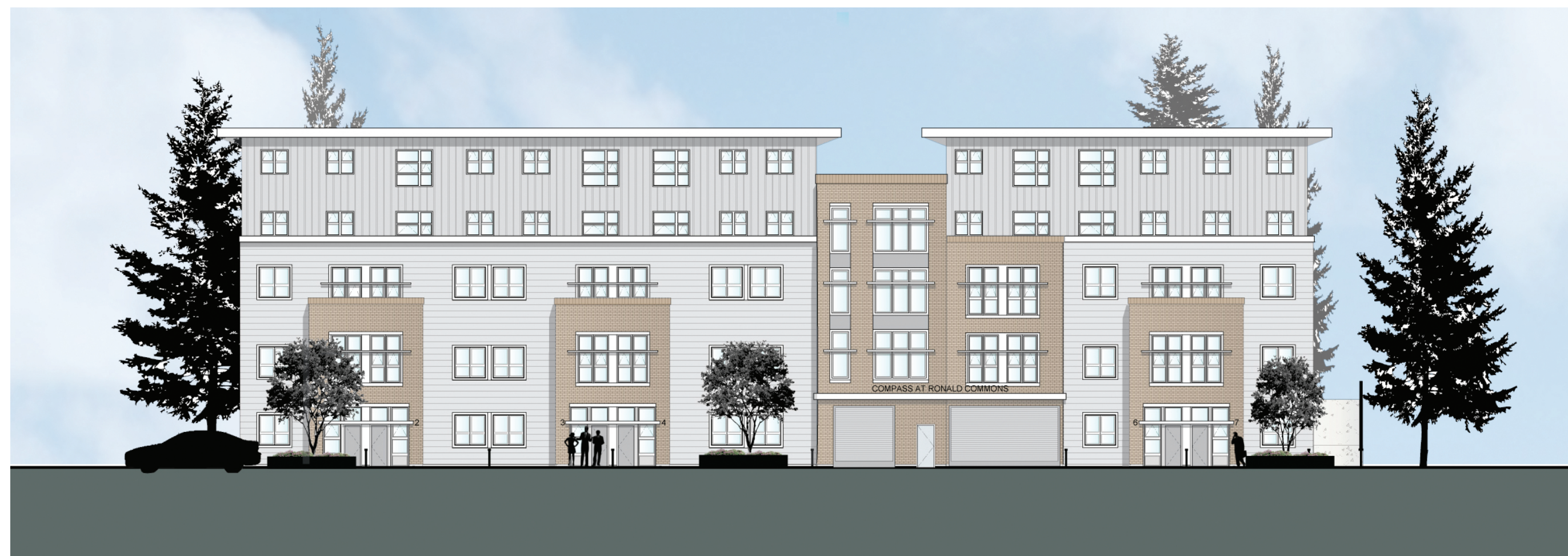
WEST ELEVATION | FACING LINDEN AVENUE